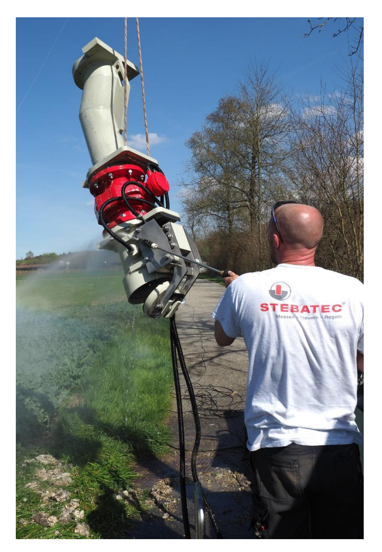
Figure 1: Cleaning work

Whether it is cleaning or replacing mechanical wear parts, monitoring functions, calibrating measuring instruments or software updates, whenever customers need support in the ideal operation of a plant from our company, we are available with our services.