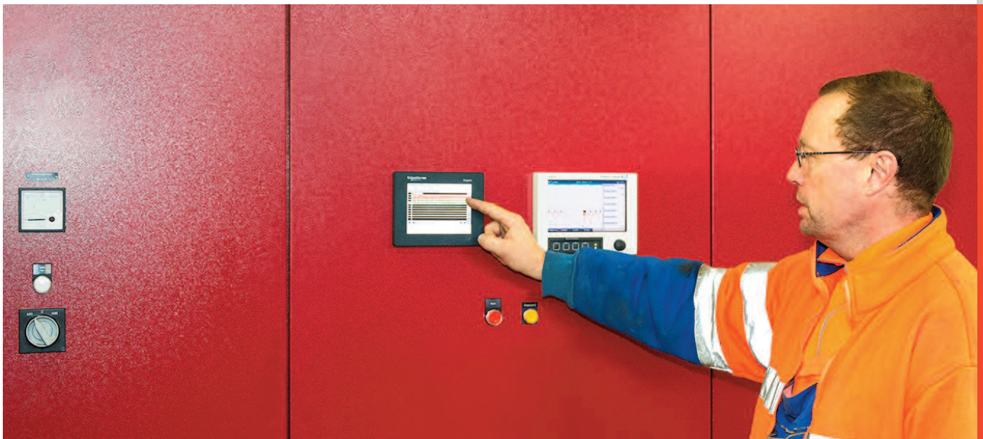
Michael Etter of the road supervisory authority of the town of Biel in the pumping station on Renferstrasse, that is equipped with STEBalarm.