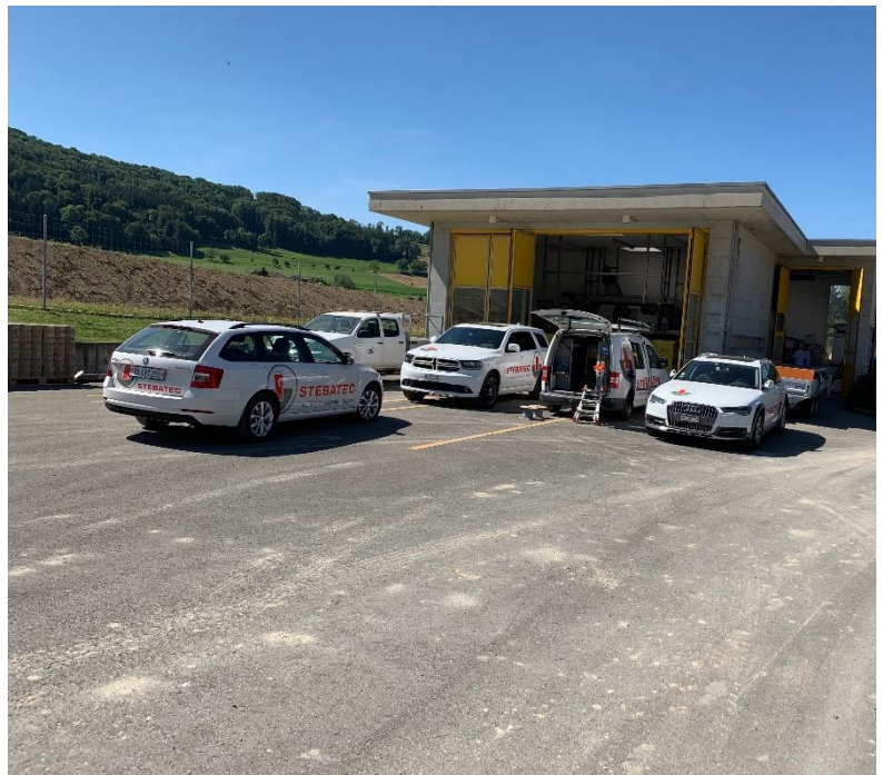
Picture 2 und 3: The old control cabinet has been replaced. Stebatec was responsible for the planning, conversion, control and commissioning - the corresponding Stebatec specialists were therefore on site on the day of conversion.