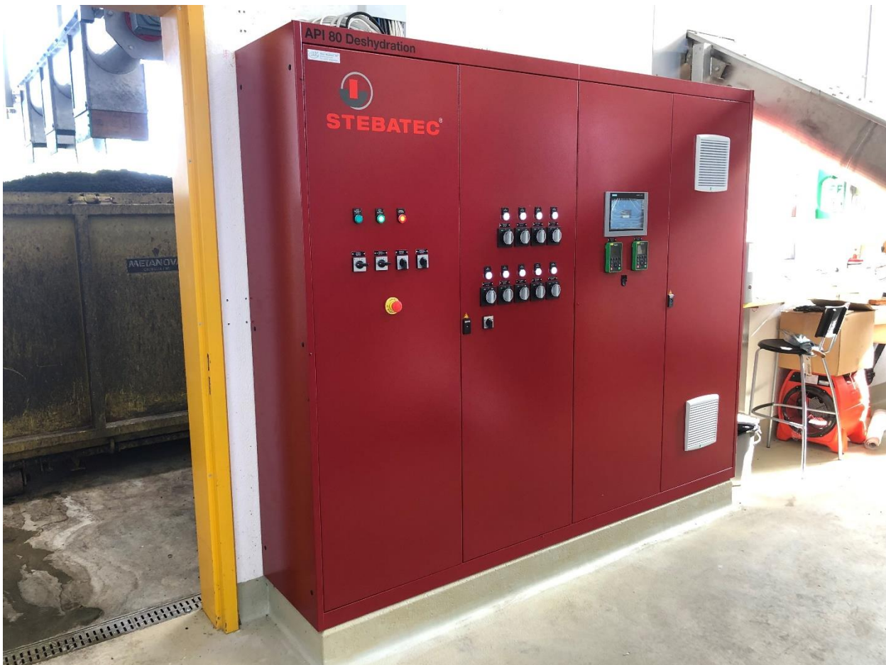
Picture 1: View after the modification of the sludge drying control system.

To replace a control system in the ongoing clarification operation requires meticulous planning, extensive preparatory measures and, ultimately, great commitment during the effective conversion phase. This was also the case during the partial conversion project for the sludge drying where Stebatec was responsible for the electrical planning, the switch cabinet construction, the software programming, the on-site reconstruction measures up to the commissioning.